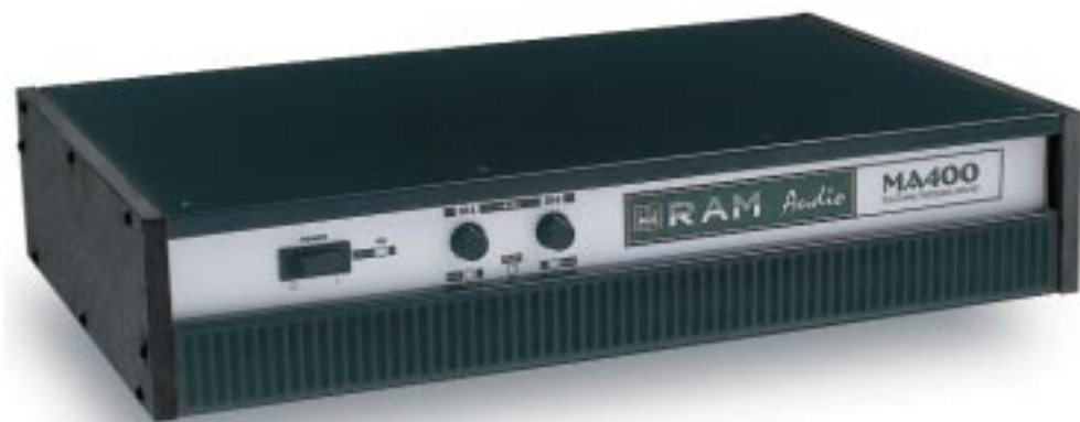
Optional wood side panels