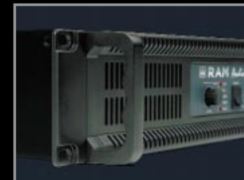
Carrying handle and flight-case ear detail