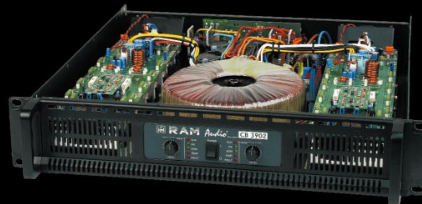
CB 3902 Class H · 2x 1960 W @20hms · 23 Kg